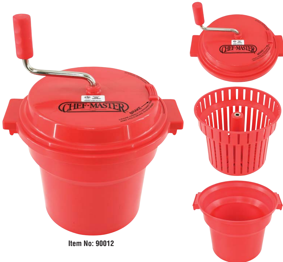
Item No: 90012