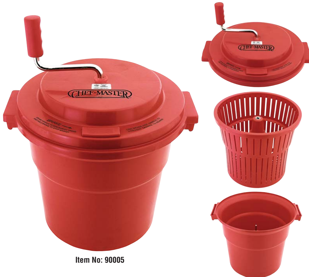
Item No: 90005